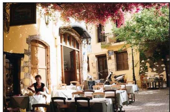
Work Anywhere with Online Writing Freedom

All these benefits are provided by Barefoot Writer to its members.